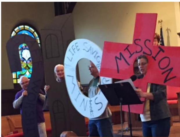
Pledging skit was performed by the Royal Central Acting Group