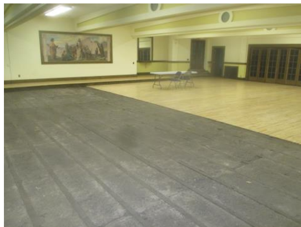
Social Hall floor pending renovation

After the damaged wood floor was removed, four companies have reviewed what was under the damaged floor. No water was found. With the companies' better understanding of the damage, new bids have been received from the companies. The Board of Trustees and Swanson Design Studios are in the process of reviewing the bids. In some cases companies will be asked to clarify their bids. As reported earlier, the companies have proposed that an interior drain system be installed with a sump pump system which would pump any water entering the damaged part of the floor out of the building and into the drain in Central's south parking lot. After we are sure that the floor has been protected from additional damage, it is planned that a new wood floor will be installed on the southern half of the room.