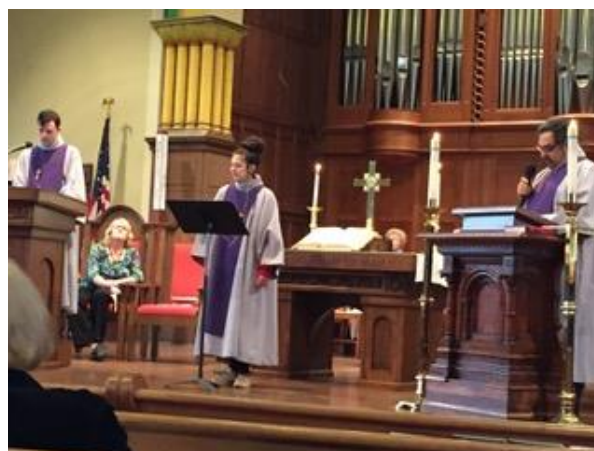
Scripture comes alive in worship

The apartment is being cleaned, painted, and flooring replaced where needed. New appliances (refrigerator and stove) will be installed. The long-term use of the apartment has not yet been determined.